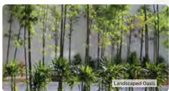
A Better Place for hemorials