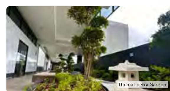
A Better Place for Columbarium